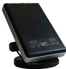
FreshAir Mobile Flexible Payments